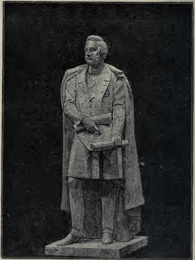
STATUE OF THE MARQUESS OF DALHOUSIE